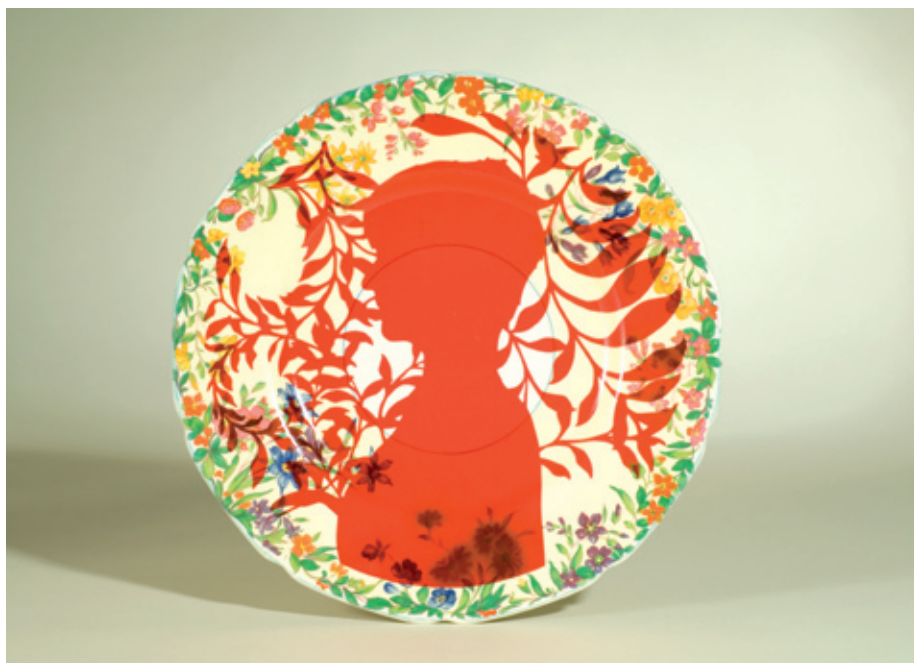
Lot #48 ▲