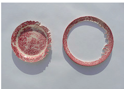
Lot #34 ▲