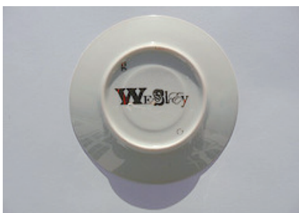
Wesley Backstamp ▲