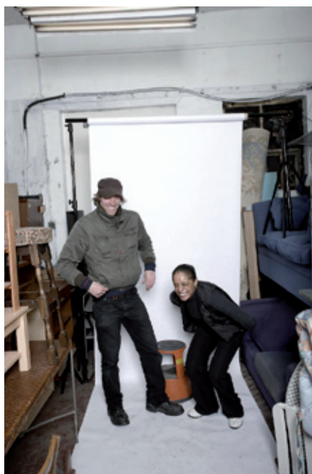
Lot #35 ▲